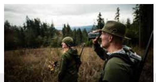
REDESIGNED USER INTERFACE The Scion OTM's polished user interface packs functionality into a rugged handheld optic

The Scion OTM is ready to capture any wildlife encounter with onboard video and image recording. Smooth 60 Hz thermal imaging preserves details on moving objects while internal storage and a built-in microSD<sup>™</sup> card slot provide enough memory for the most demanding trips. Additional Bluetooth and Wi-Fi capabilities allow simple file transfer between devices.